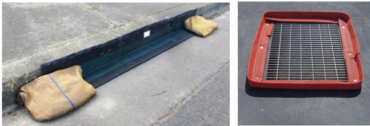
Samples of Inlet Protection Devices.

Vehicle washing activities must comply with applicable regulations and cannot cause a discharge to the storm drainage system. Ideally, vehicles will be washed indoors in a location with floor drains connected to the sanitary sewer system to capture wash wastewater. If indoor washing is not viable, a storm drain inlet protection device should be used. An inlet protection will trap runoff before it enters the storm drain system and allow it to be collected and discharged properly to the sanitary sewer system.