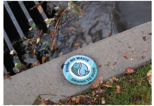
This storm drainage inlet, also known as a catch basin, collects runoff from a street in Downtown Boise.

It is important to remember that in the Boise area, the storm drainage system is separate from the sanitary sewer system. The storm drainage system does not flow to a treatment plant and instead discharges directly into the Boise River or other local waterways as shown in the diagram.