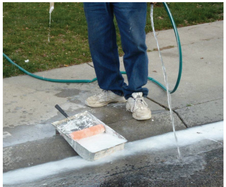
Paint disposal into a gutter, as shown in this picture, is not permitted and is an illicit discharge to the storm drainage system.

In the Lower Boise River watershed, Boise, Garden City and the Ada County Highway District have enacted regulations to prevent Illicit Discharges to the storm drainage system. These regulations can be reviewed on the Partners for Clean Water website partnersforcleanwater.org