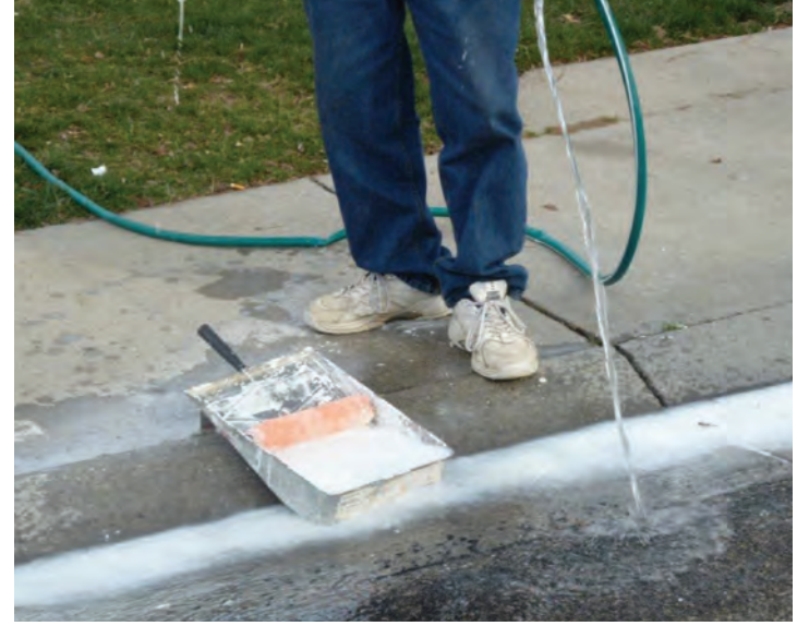
Paint disposal into a gutter, as shown in this picture, is not permitted and is an illicit discharge to the storm drainage system.

In the Lower Boise River watershed, Boise, Garden City and the Ada County Highway District have enacted regulations to prevent Illicit Discharges to the storm drainage system. These regulations can be reviewed on the Partners for Clean Water website partnersforcleanwater.org