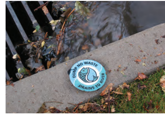
This storm drainage inlet, also known as a catch basin,

There are many types of stormwater pollutants including litter, oils, grease, chemicals, fertilizers, pesticides, sediment and bacteria. These pollutants come from many sources, primarily generated by the activities of people on our lands. For example, excess nutrient pollution can be generated from residential or agricultural areas when too much fertilizer is used on lawns or crops. Pollutants like litter or oil and grease can flow to the storm drainage system from roadways or parking lots.