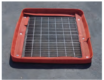
Samples of Inlet Protection Devices.