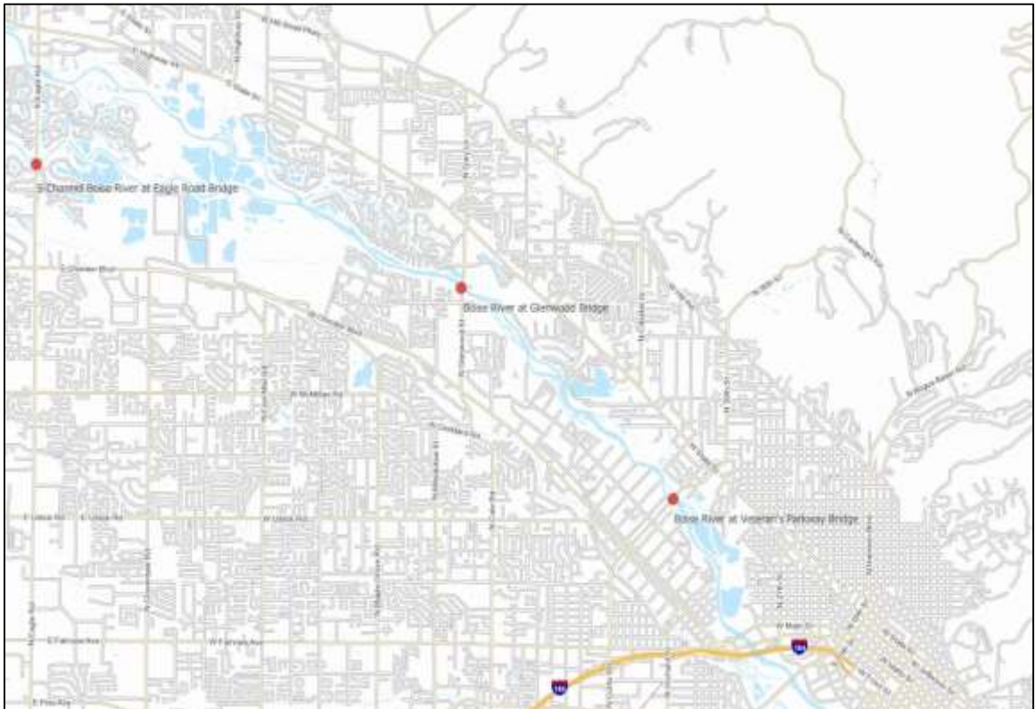
Figure 1: Location of Boise WWTF Instream Monitoring Locations

The City has high quality data for the Boise River in the MS4 reach since before the Boise/Garden City MS4 permit was issued in 2000 for all four pollutants of concern as identified in the 2012 Boise/Garden City MS4 permit. The City has used this data to assess the effectiveness of the Boise/Garden City MS4 program.